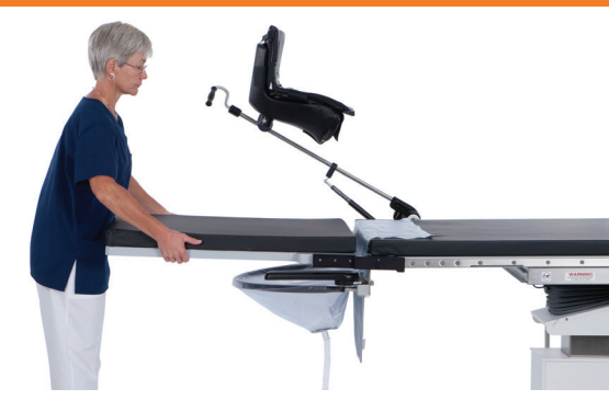
Lightweight, radiolucent tabletop extension