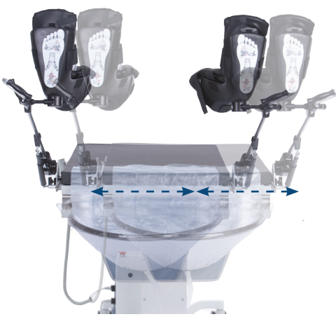
Transverse travel: ± 3.5", 7" total