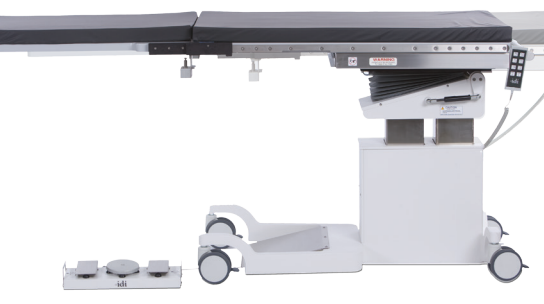
Longitudinal tabletop travel: 10"