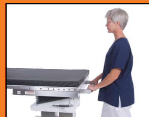
Built-in transport handle