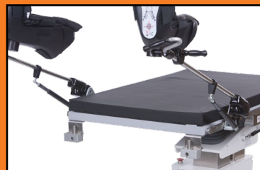
Metal-free perineal end of table: unobstructed imaging access to edge of tabletop.