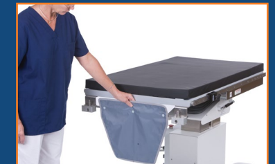
Removable lead-vinyl x-ray shield

Pendant hand control and footswitch control