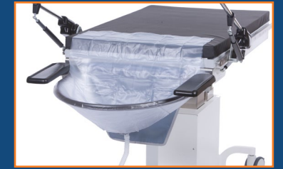
Removable, collapsible drain bag support (elbow rests are optional)