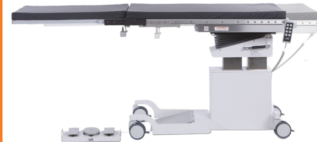
Longitudinal tabletop travel: 10"