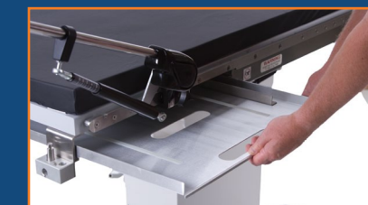
Removable radiographic cassette tray: loads from either side of table. Accepts cassette with grid cap or mobile DR detector.