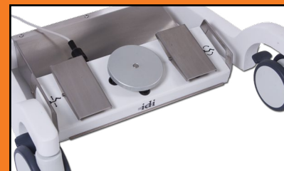
Built-in footswitch storage tray