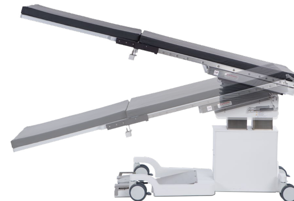
Trendelenburg: \pm 15^\circ