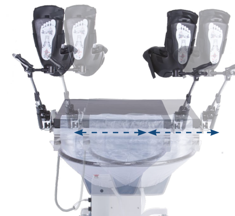
Transverse travel: \pm 3.5" , 7" total