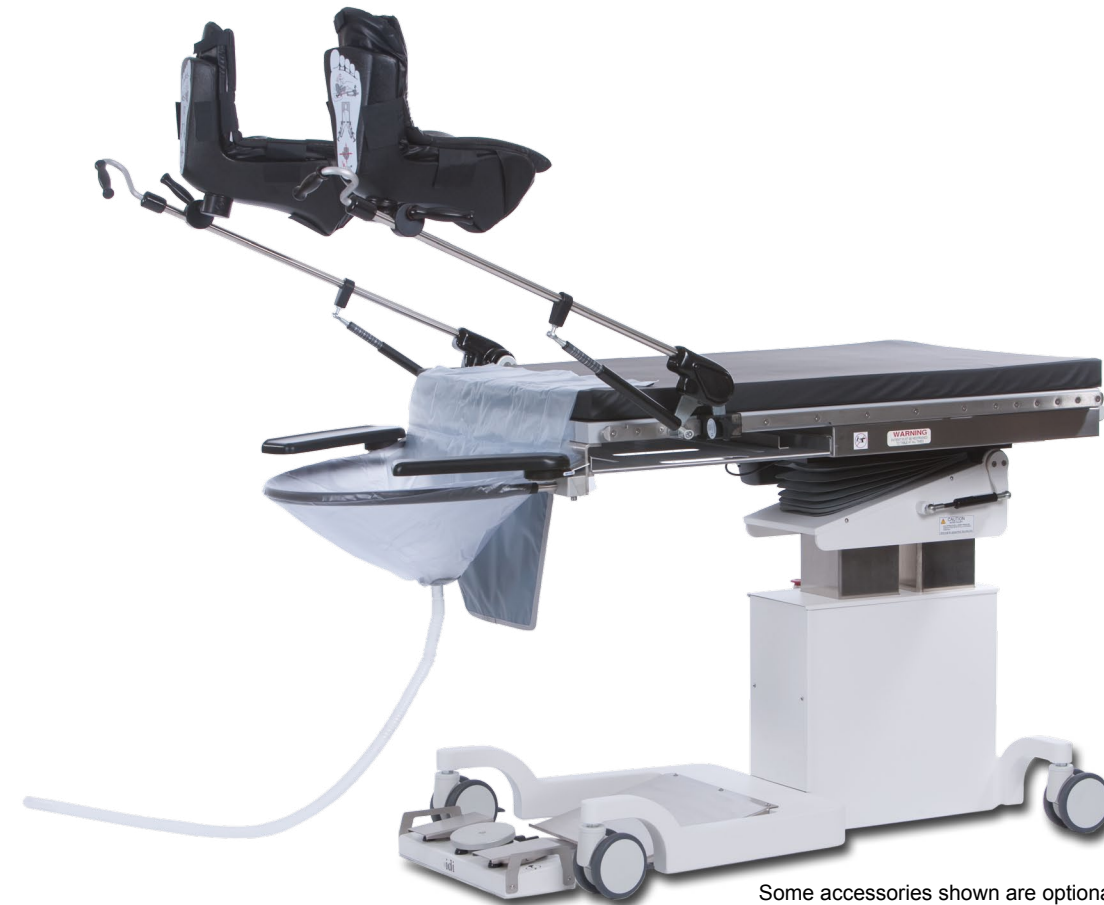
Some accessories shown are optional

Imaging table for urology and multi-purpose use