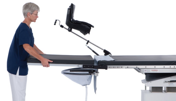
Lightweight, radiolucent tabletop extension